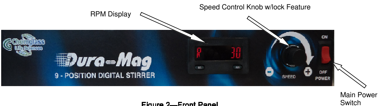
Figure 2—Front Panel

To operate, turn the main power switch to the “ON” position. Turn the speed control knob to set the desired rpm value. The units are designed to operate within a range of 25-400 rpm. Adjust the speed by turning the speed control knob, CW to increase speed, CCW to decrease it. The unit will ramp up (or down) to your selected speed. Turn the “LOCK” ring clockwise about an eighth of a turn to prevent any inadvertent changes to the set speed. Turn the “LOCK” ring counterclockwise to unlock the speed control knob.